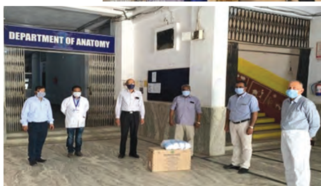
Charitable activities carried out by Eparchy of Satna during Covid-19 pandemic.