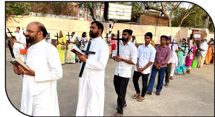
Way of the Cross at Cathedral