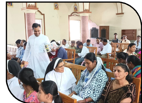
Discussions on Synod on Synodality