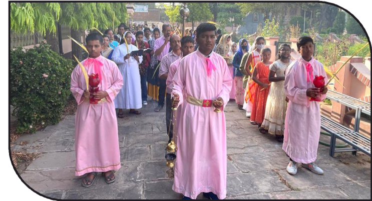
Palm Sunday Celebration at Cathedral