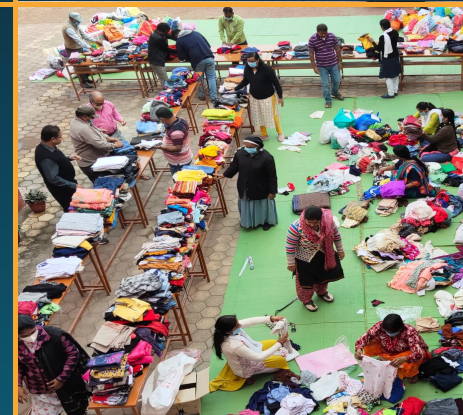
Old Clothes Distribution Drive at Panna