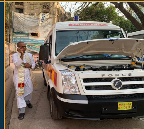
Blessing of Samaritan's New Ambulance