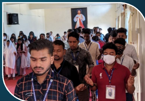
Youth Regional Zonal Meet at Sagar