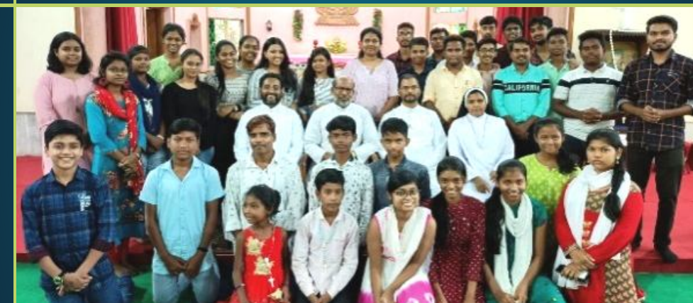
Satna Zonal Youth at Cathedral