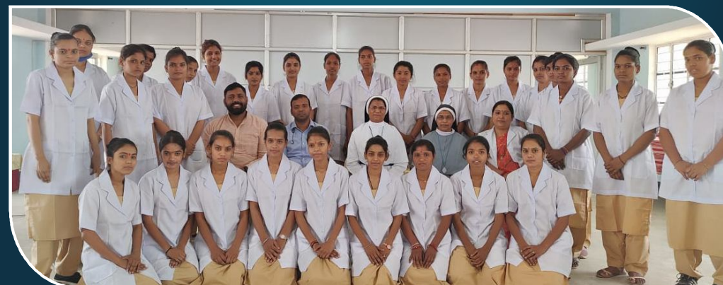
Uniform Distribution Day at Community College, Pateri