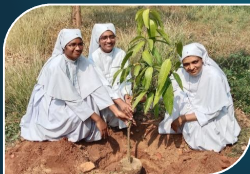
Sisters Planting Tree on the Platinum Jubilee of CSN